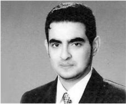
The picture above is of al-Balawi, the assailant responsible for the CIA bombing and seven deaths.